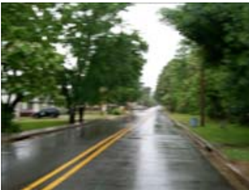
Street Scene Left Photo